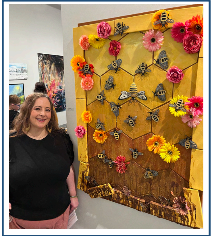
KIM MORRALL: “Survival of the Richest”, mixed media.