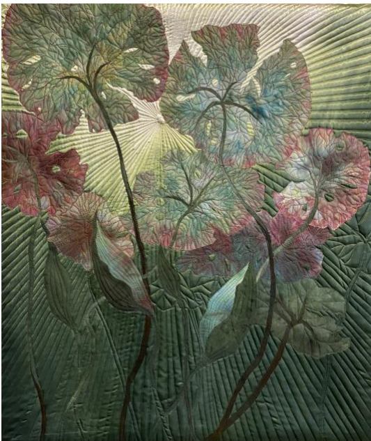
LORNA BORYSKI, "Hummm", 11" x 14", coloured pencil on paper.

Dyed and painted fabrics, 27.5" x 32.5". This is the first of what might be a series inspired by our northern aquatic plants. Pieces are applied to the base cloth, then batted, decoratively stitched, and quilted.