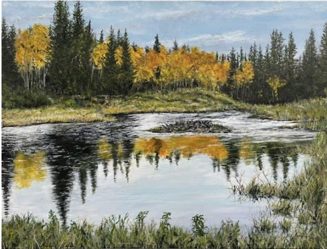
ANNETTE HENBID, "Beaver Pond in Fall", Acrylic.