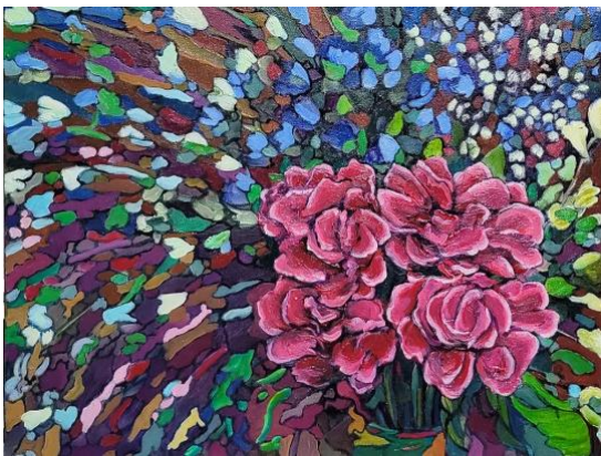
"Roses Are..." , Kathie Bird, 14" x 18", oil on canvas, $315.