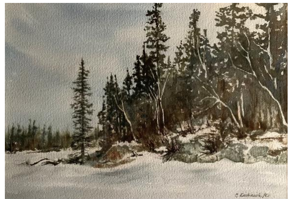
"Island In the Sun" , Caron Dubnick, 22" x 18" framed, watercolour, $375.