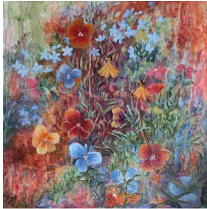
"Garden Dancers" , Beryl Fournier, 20" x 20", Acrylic on canvas, $400.