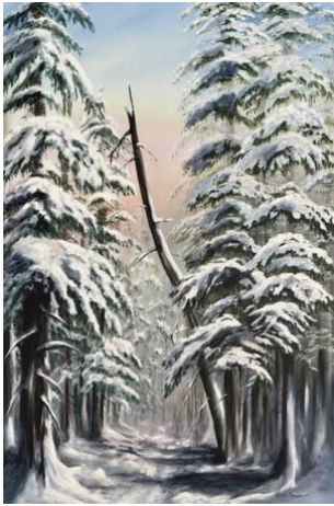
"Snow Trail" , Helen Croissant, 24" x 36", acrylic, $545.